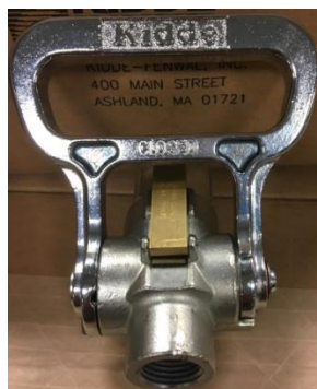
Figure 1: Horn-Valve with Horn removed